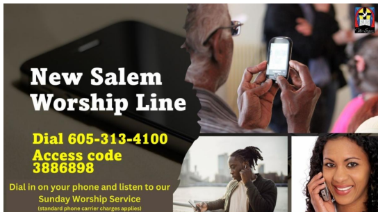
Click image to enlarge it and view in more detail.