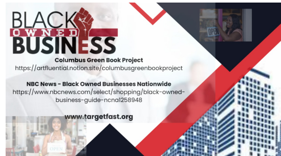
Click image to enlarge it and view in more detail.