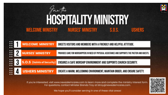
Click image to enlarge it and view in more detail.

The Hospitality Ministry is looking for volunteers in the following areas: S.O.S. (Saints of Security), Ushers, Welcome Ministry, and Nurses' Ministry.