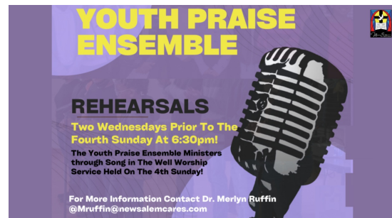
Click image to enlarge it and view in more detail.