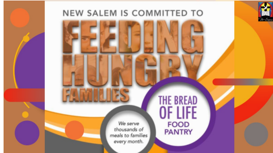
Click image to enlarge it and view in more detail.

Prayer: LORD, thank you for never wasting a tear and helping us see the pain in another's eyes so, we can reach deep and encourage. [In Jesus Name] Amen.