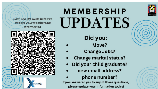
Click image to enlarge it and view in more detail.