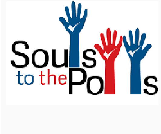
Click image to enlarge it and view in more detail.