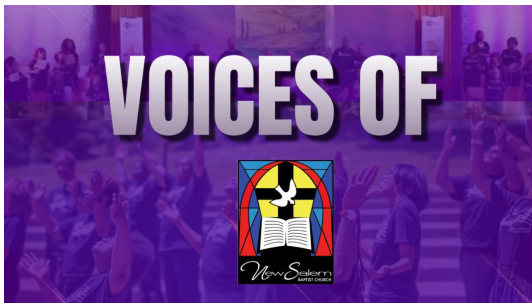
Click image to enlarge it and view in more detail.