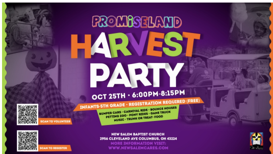
Click image to enlarge it and view in more detail.