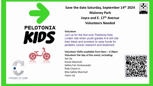
Click image to enlarge it and view in more detail.