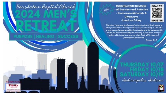
Click image to enlarge it and view in more detail.

Mark your calendars because it's almost time for our Annual Harvest