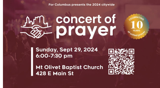
Click image to enlarge it and view in more detail.