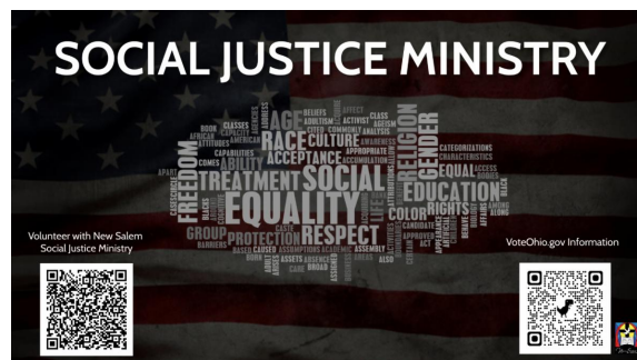
Click image to enlarge it and view in more detail.

Attention retired and current certificated teachers and college students wanting to give back to