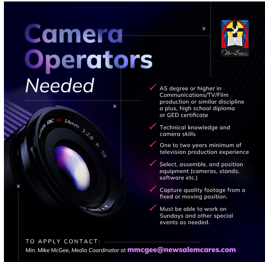
Click image to enlarge it and view in more detail.