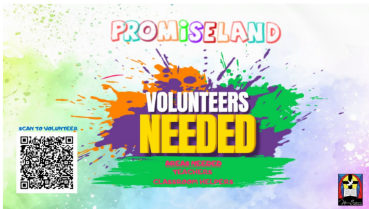
Click image to enlarge it and view in more detail.