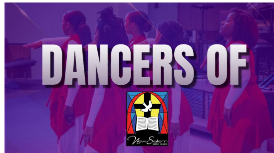
Click image to enlarge it and view in more detail.