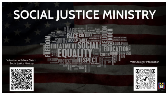
Click image to enlarge it and view in more detail.

PRAYER: LORD, free us from the stuck places, and guide us into your will, your light, your plan. You'll guide us by the 'right hand' (see Psalm 73:23). We pause to pray for broken hearts that are stuck, wayward attitudes that can't be free due to unforgiveness, the quicksand that has us locked in of doubt, fear, and discouragement. Free us, Lord! We surrender all. Psalm 139:10 ESV reminds us, "Even there your hand shall lead me, and your right hand shall hold me." AMEN.