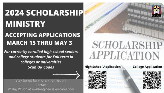
Click image to enlarge it and view in more detail.